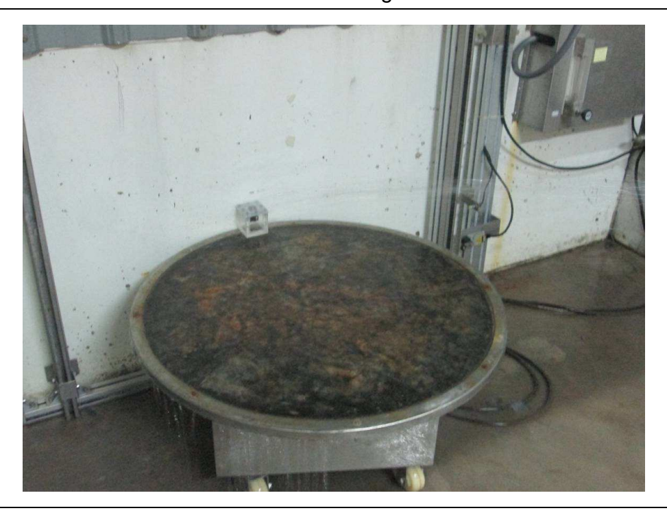
IPX5 after the test