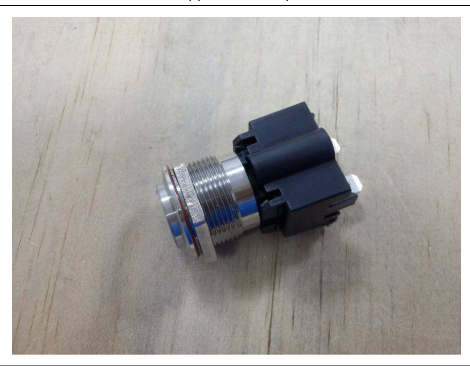
The appearance of photo