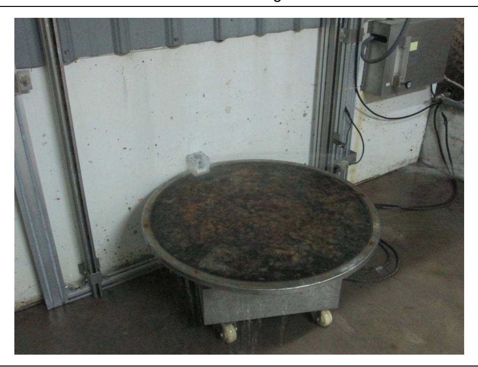
IPX5 after the test