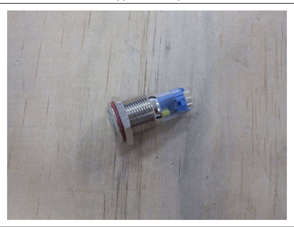
The appearance of photo