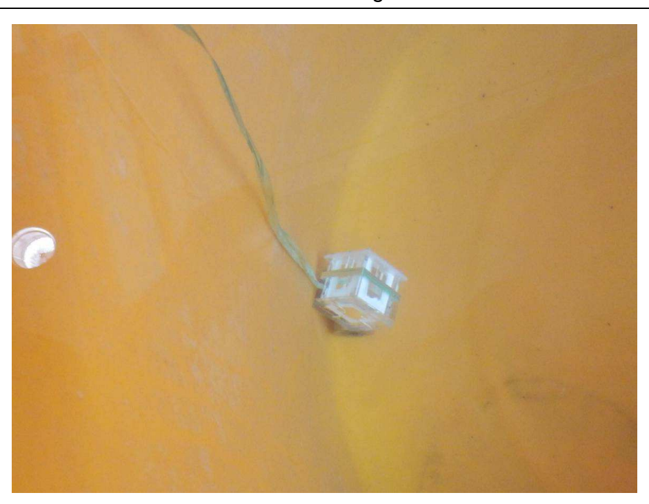
IPX7 after the test