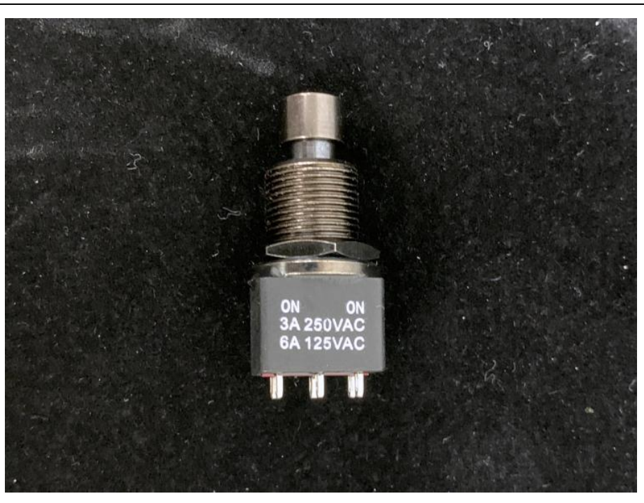
The appearance of photo