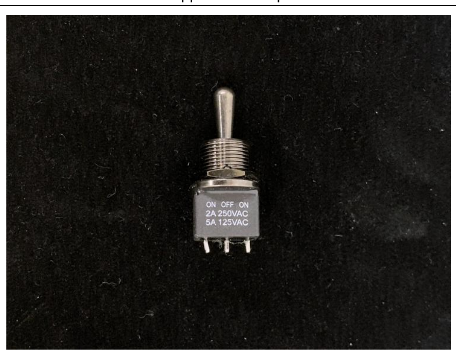
The appearance of photo